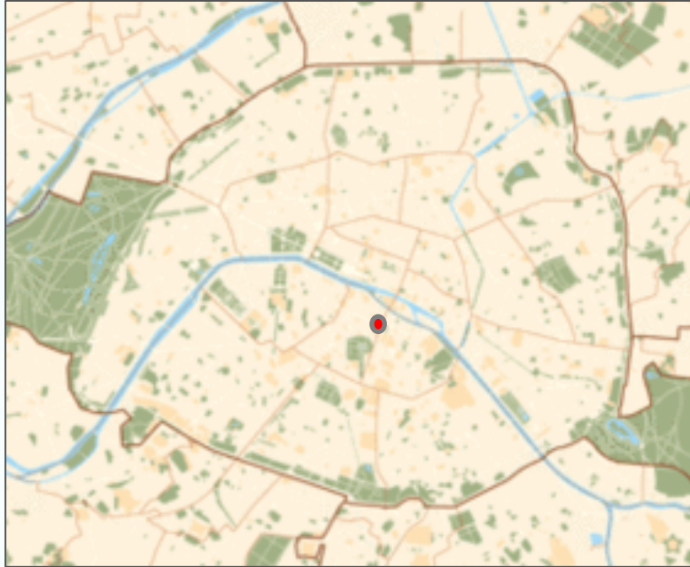
Localisation sur la carte de Paris